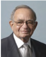
Leo Melamed Permanent Special Advisor to the Executive Committee & Board of Directors Chairman Emeritus CME Group, Inc. Chairman & CEO Melamed & Associates